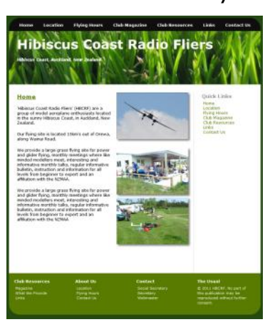
The homepage of the new website

all servos included and mounted, a speed controller and a brushless motor installed - all you